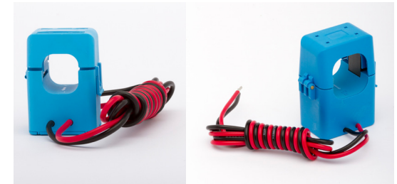
SPLIT 24MM and 36MM I/D. our most popular, covering most applications. Available up to 250A (24MM) and 600A (36MM)