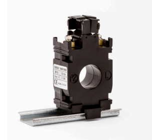
SOLID - a budget friendly choice