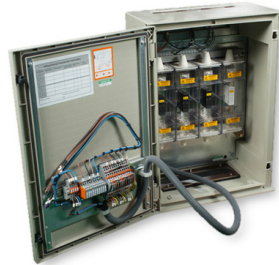
COP5 CT CHAMBER