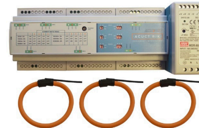
ROGOWSKI - rope CTs for difficult installs