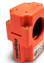
WIRELESS - for installs where the power can't be shut down, e.g Data Centres