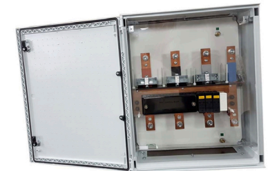
REGIONAL UTILITY COMPANY SPEC